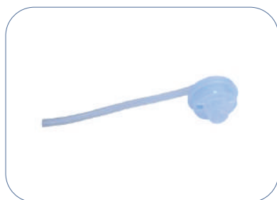
Exhalation Valve LS-AD004-0