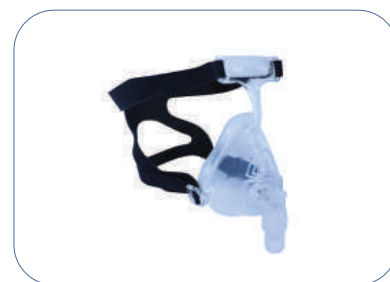
Mask (Adult/Ped) LS-AD006-0