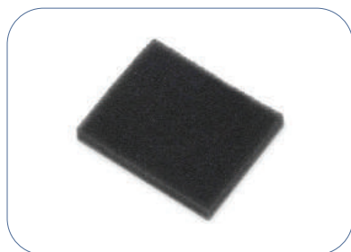
Cabinet Air Filter LS-A004-0