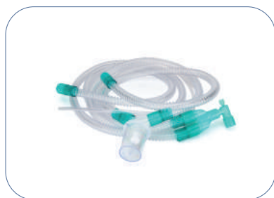
Breathing Circuit LS-AD001-0