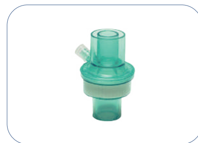
Viral / HME Filter x3 LS-AD003-0