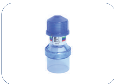
PEEP Valve LS-AD002-0