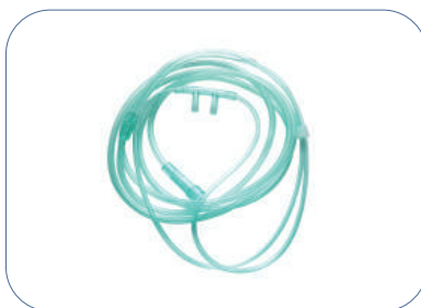
Nasal Cannula LS-A002-0